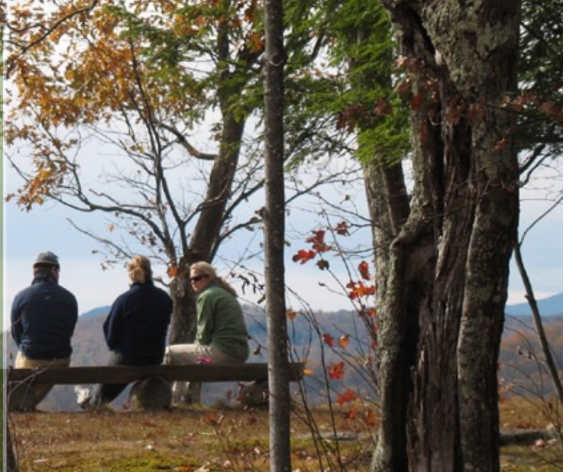
South Peak Bench