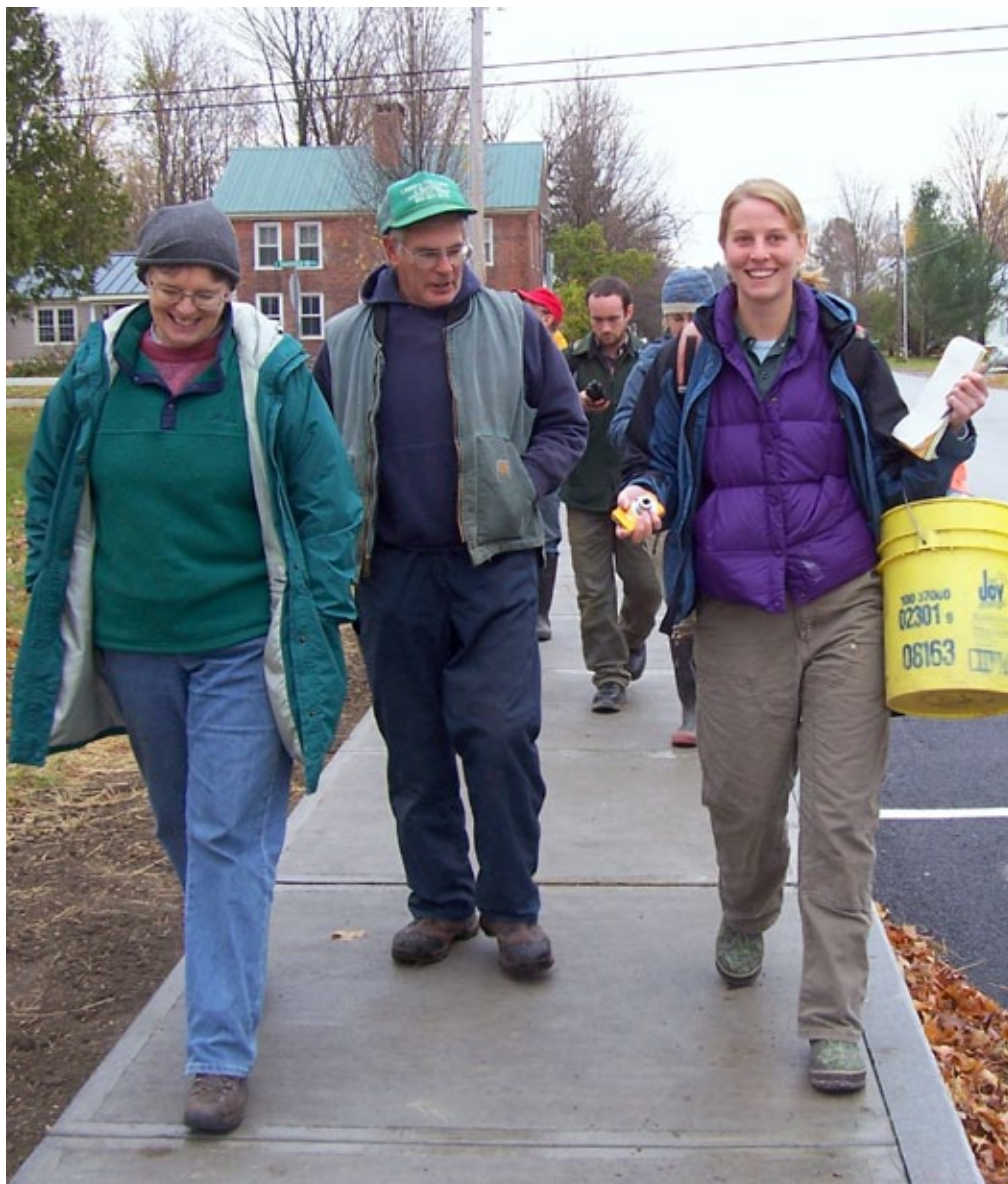
Historic Faulkner Trails

Bakersfield created its first conservation commission just over a year ago and already they have achieved a significant conservation success by acquiring a 4-acre parcel in the center of the village that will serve as a new Town Park, as well as a focal point for a Village Center trails system. Creating a system of walking trails on private and public lands that highlight the area's unique ecological regions, historic legacy, and natural beauty is one of the primary goals of the Commission. RTCA has helped the Commission to define and focus their trail goals and begin development of a village walking loop that incorporates the new Town Park land.