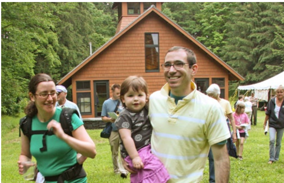
Bakerfield Community Trails

Restoration of a historically significant set of trails on Mount Tom that is a central component of the 30-mile Woodstock Trails System and gateway to the Marsh-Billings-Rockefeller National Historical Park.