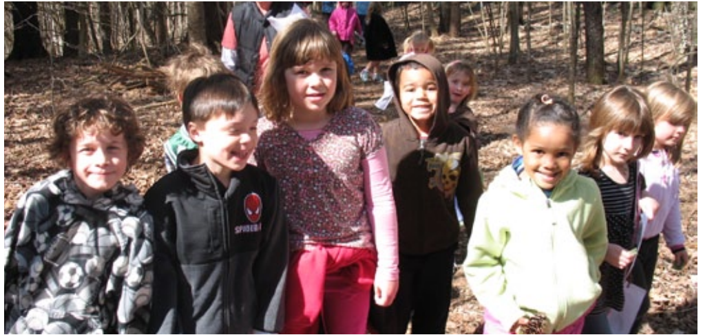
Kids enjoy a hike on Mt. Peg in Woodstock, Vermont

Establish a system of village and up-land walking trails for the community of Bakersfield that linking private and public lands and promote exploration of the area's natural and cultural heritage.